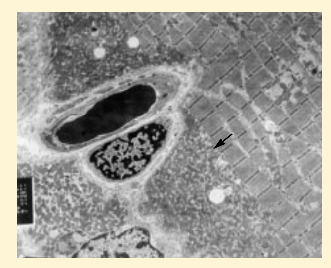
FIGURE 2. Electron photomicrographs of muscle biopsy samples from two patients with mitochondrial disease. Left, large mitochondria with needle-like paracrystalline inclusions (arrow) in a patient with dementia and intractable epilepsy. Right, pathologic accumulation of mitochondria (arrow) in the subsarcolemma of muscle tissue.

Aside from a handful of case reports in which an enzyme defect was due to cofactor deficiency or was very cofactor-responsive, there is no overwhelming evidence that the use of cofactors is helpful in most patients.